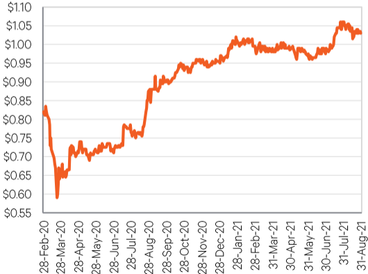
Share price since the announcement of Wilson Asset Management as investment manager

The principle of the Premium Target is that WAM Alternative Assets' volume weighted average share price, over the relevant trading days during a month, needs to exceed the pre-tax NTA. If this does not occur at least three times during the five-year term, shareholders will automatically have the right to vote to terminate the arrangements with Wilson Asset Management, and to liquidate the Company.