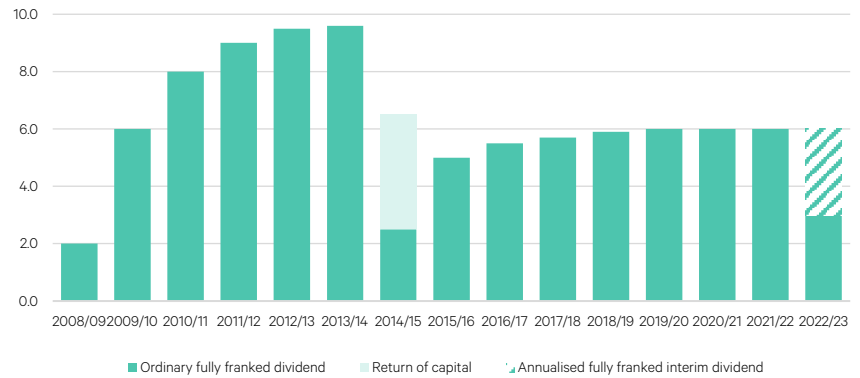
WAM Active dividends since inception (cents per share)