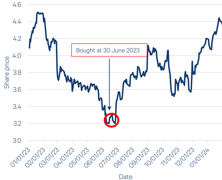
Harvey Norman share price performance